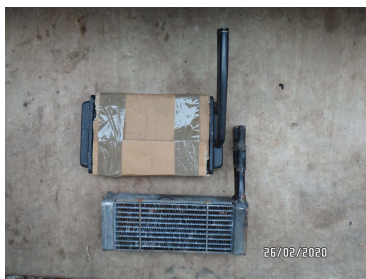
MB matrix v Transit (MB is the smaller)