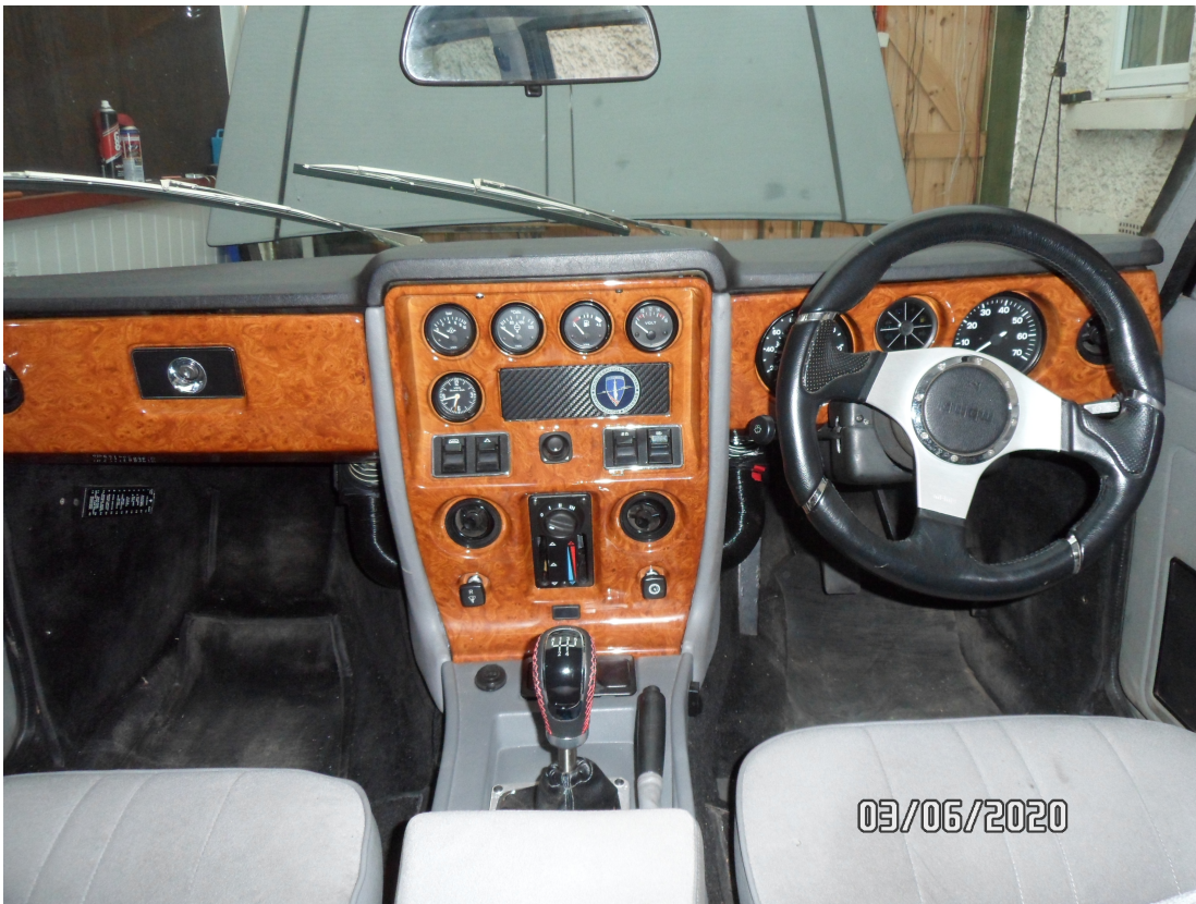
Heater ducting can be seen here (just) either side the centre console.