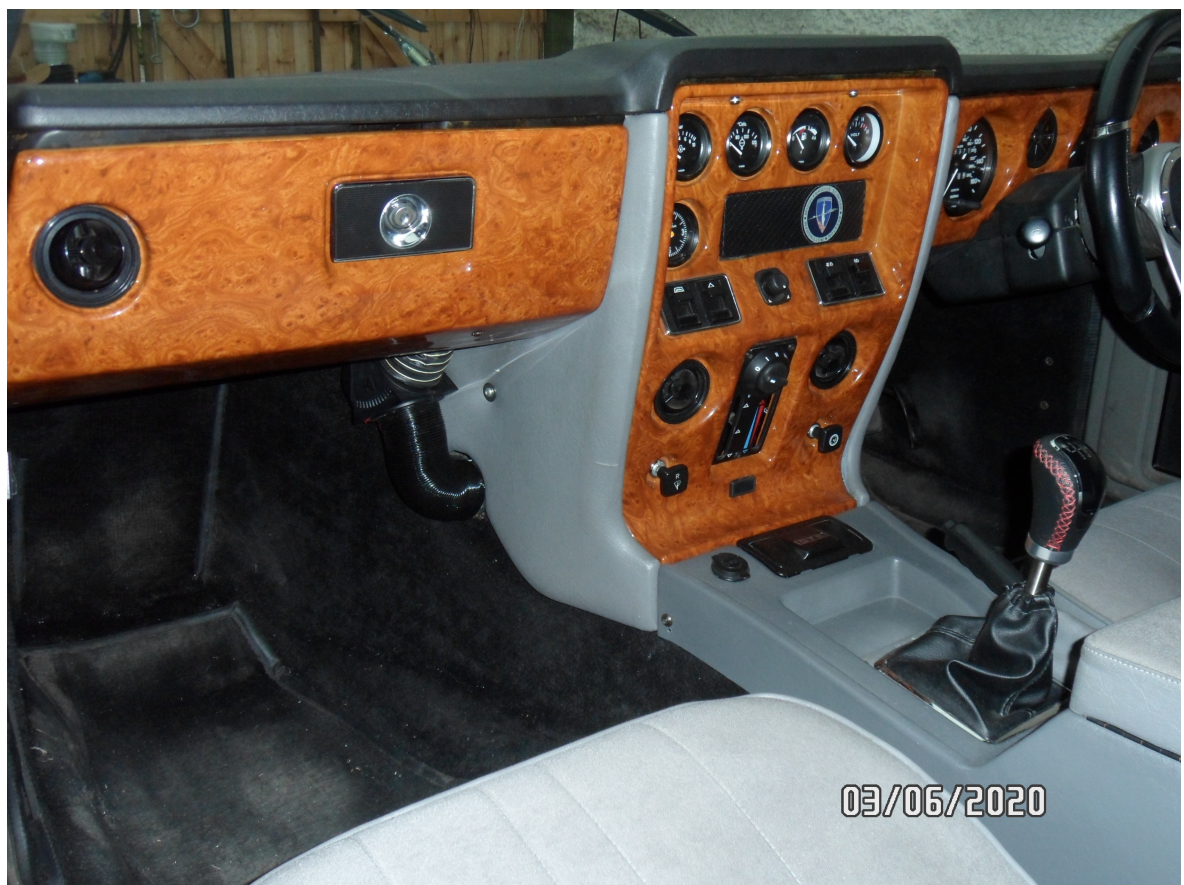
Better view here of ducting to diverter valve.