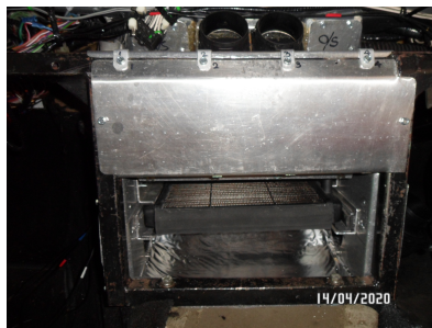
Heater box showing matrix