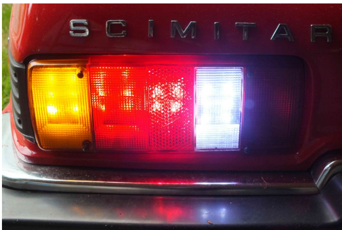
Left: All LED units.