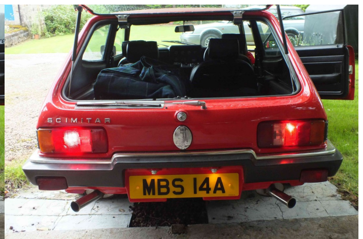
Right: Rear Lights Only.