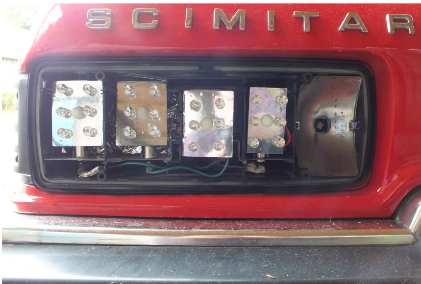
Above: Light boards fitted in the lamp cluster.