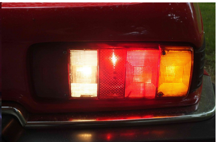
Right: All Incandescent Bulbs.