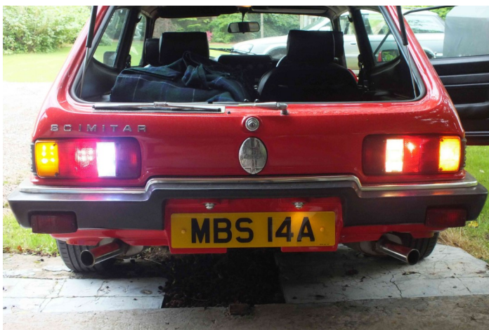
Left: All Lights.